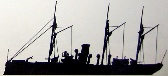
"YORKTOWN" Launched 1888 Length 230'